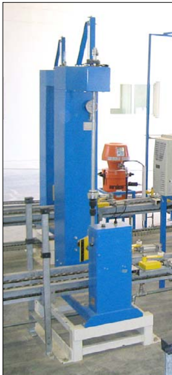
PVS valve changing machine for installation in chain conveyor