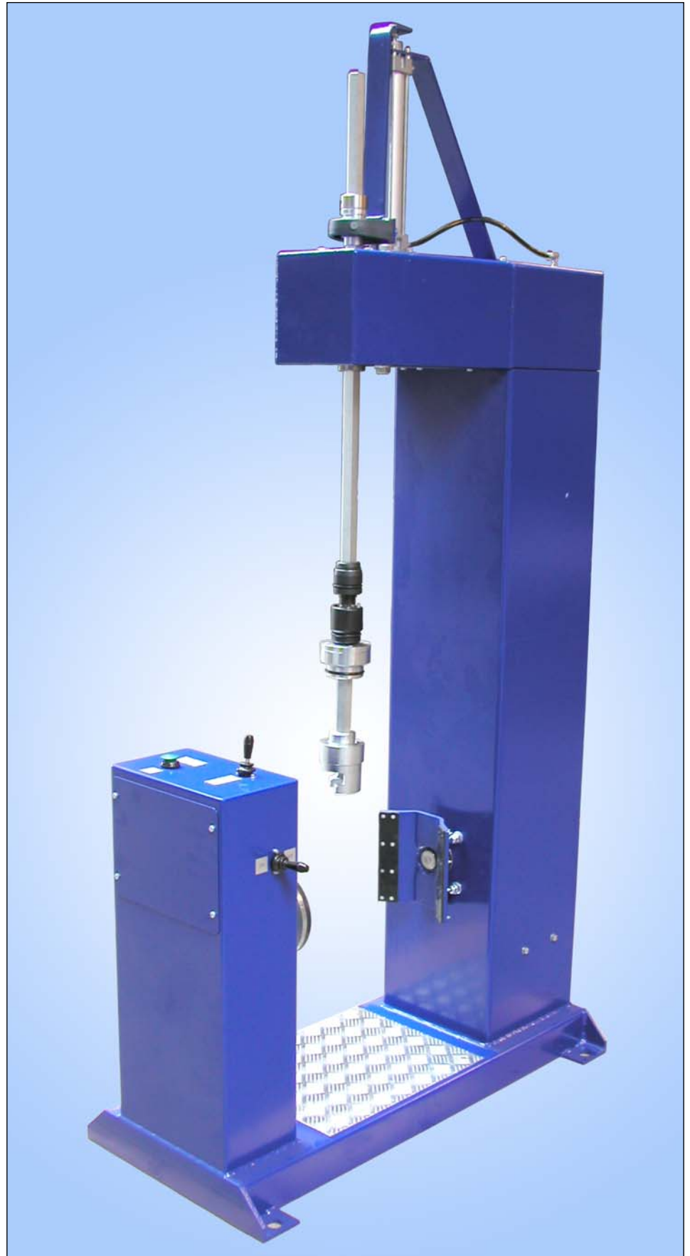
PVS valve changing machine for stationary installation on floor