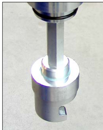
Each valve changing key can be fitted to the valve type in question (or possibly to the valve types in question)