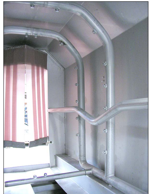
A piping system with fitted nozzles is installed on the inner side of the washing tunnel. The piping system as well as the placement of the nozzles is adapted to the relevant cylinder type(s), which ensures an optimal washing result.