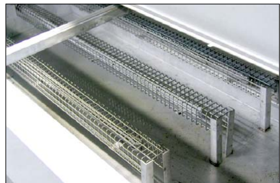
The integrated heating elements ensure that the soap water has the right temperature