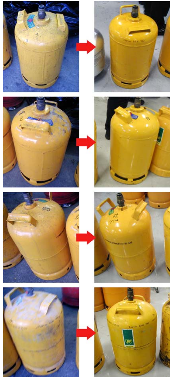
The above series of pictures illustrates cylinders, which have been washed one time in a standard washing system