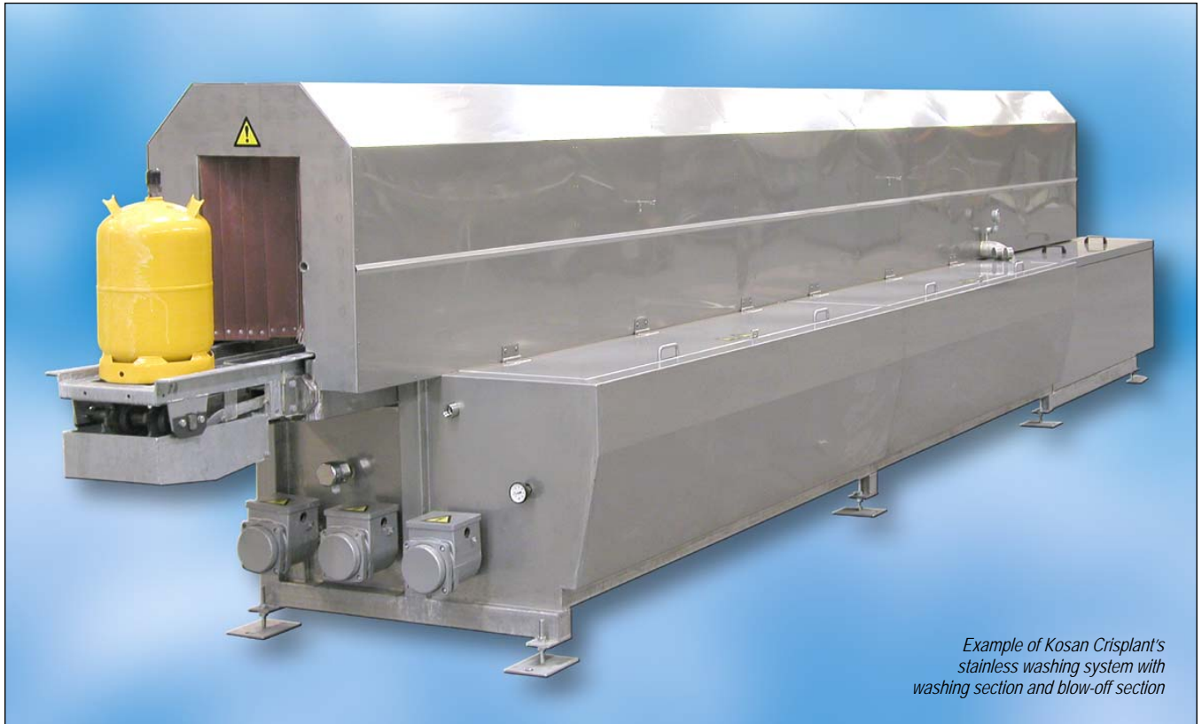
Example of Kosan Crisplant's stainless washing system with washing section and blow-off section

Kosan Crisplant's washing systems specially designed for LPG cylinders are developed in cooperation with leading suppliers of industrial washing machines. The washing systems are highly efficient and ensure optimal cleaning of the cylinders.